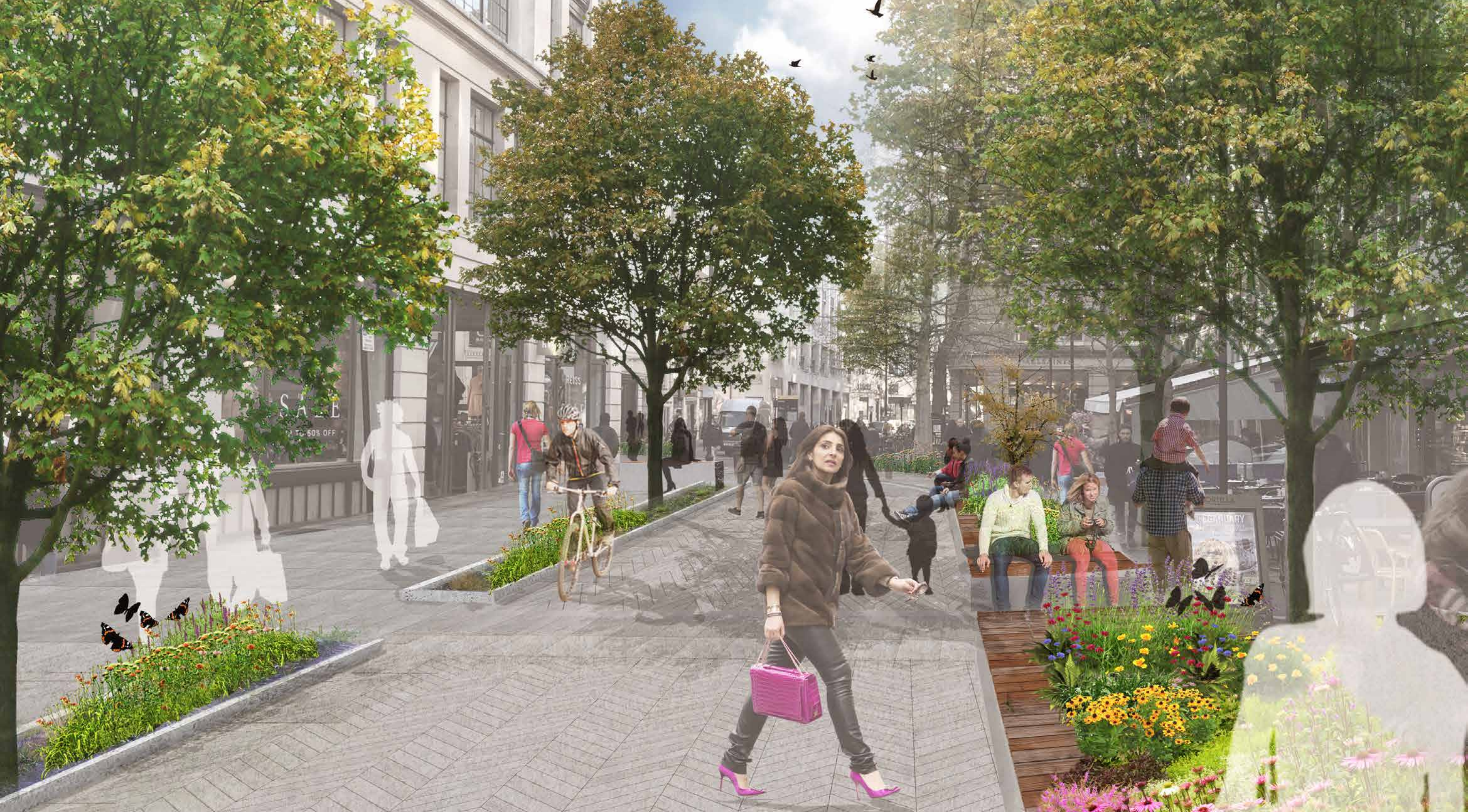
Concept visualisation looking west along Market Place