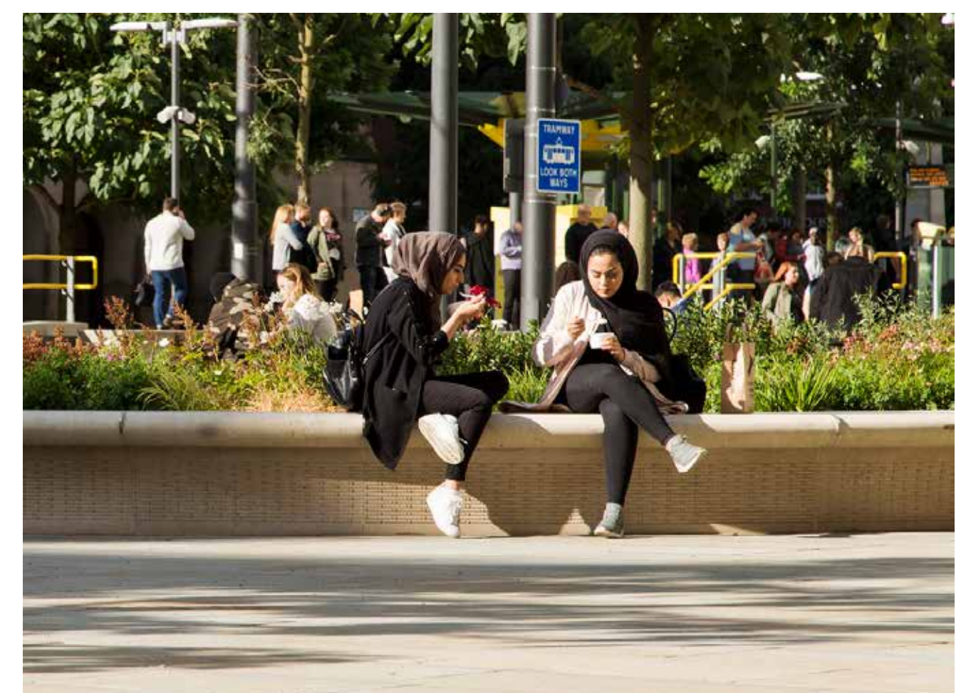
Precedent image showing seating integrated with planter ©Latz+Partner Stalwart Films