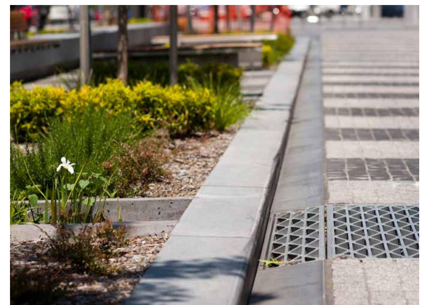
Precedent image showing sustainable drainage rain water capture